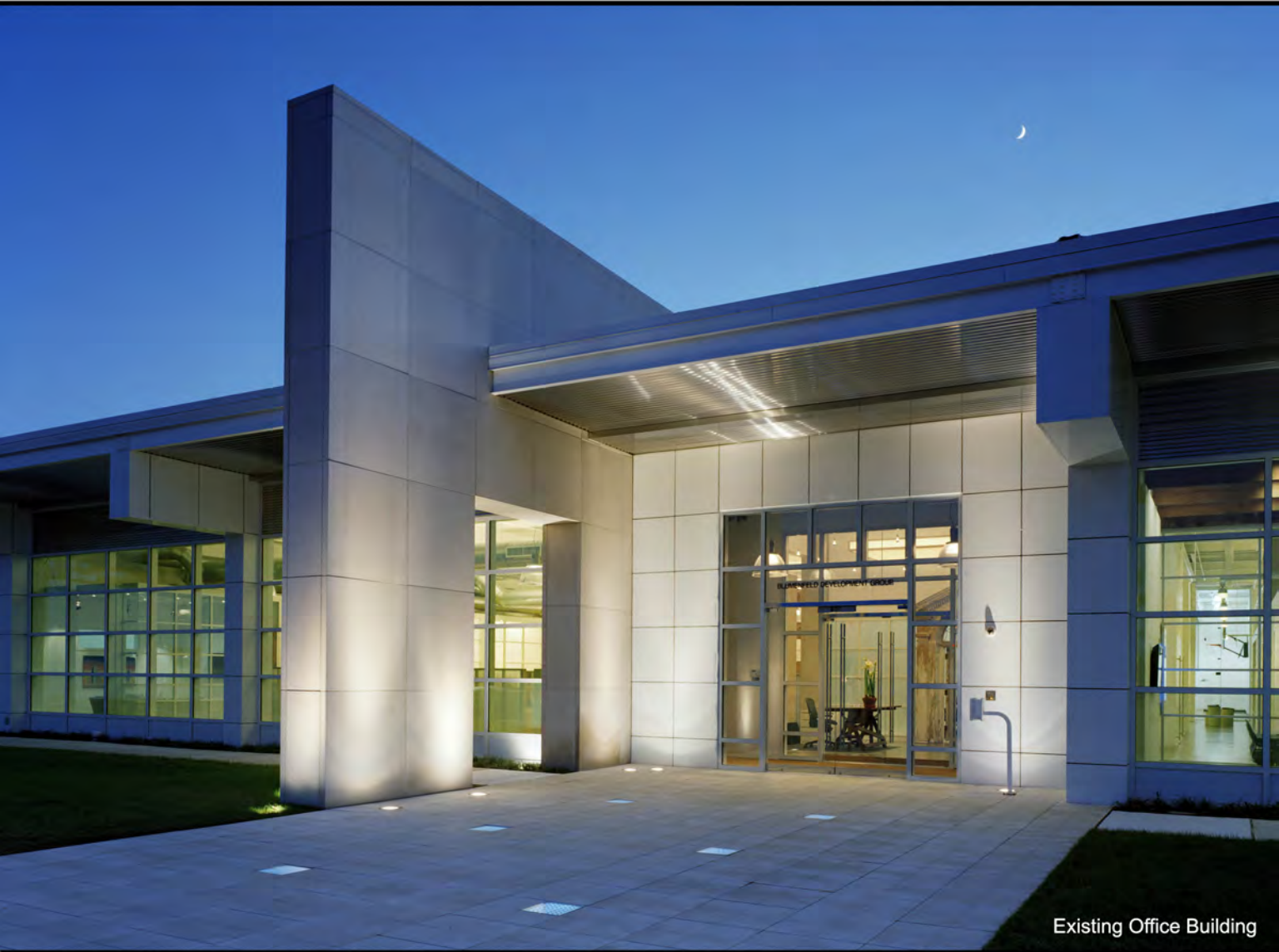
Existing Office Building

LOCATED A QUARTER MILE NORTH OF THE LONG ISLAND EXPRESSWAY ON ROBBINS LANE SYOSSET, NY